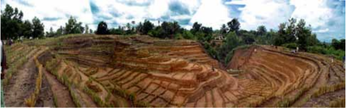
Photo 6: Panoramic view of the ITPK Ravine, showing Vetiver hedges along contour lines

However, 60 days after planting (photos 6 and 7), these plants had reached their average growth level, leaves started to reach normal heights and the new tillers had grown from the base. Consequently, hedges density was also average, that is, one could still see space and distinguish between the plants in the hedgerow (Photo 7).