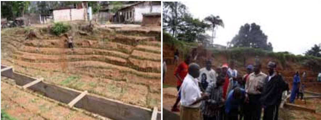
Photo 1: Property threatened and community concerns and participation

The erosion problem in the town of Kikwit mostly affects the local population who are the first victims. To realize the objectives of this project, notably to show the local population new anti-erosion techniques with the Vetiver Zizanioides , it was necessary to first mobilize the local community in order to implicate them directly in this endeavor (Photo 1)