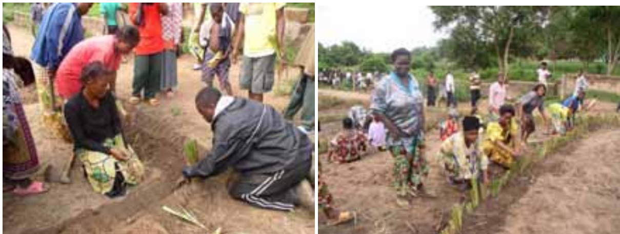
Photo 2: Community support and participation through demonstration

months, from October 2004 until September 2005. Implicating the local community in multiplying vetiver had a double advantage; not only did it allowed the population to amass vegetative materials for their individual needs, it also offered them a new source of income through the sale of the vetiver shoots (Photo 2).