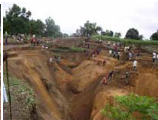
Re-profiling the slopes of ravine ITPKA