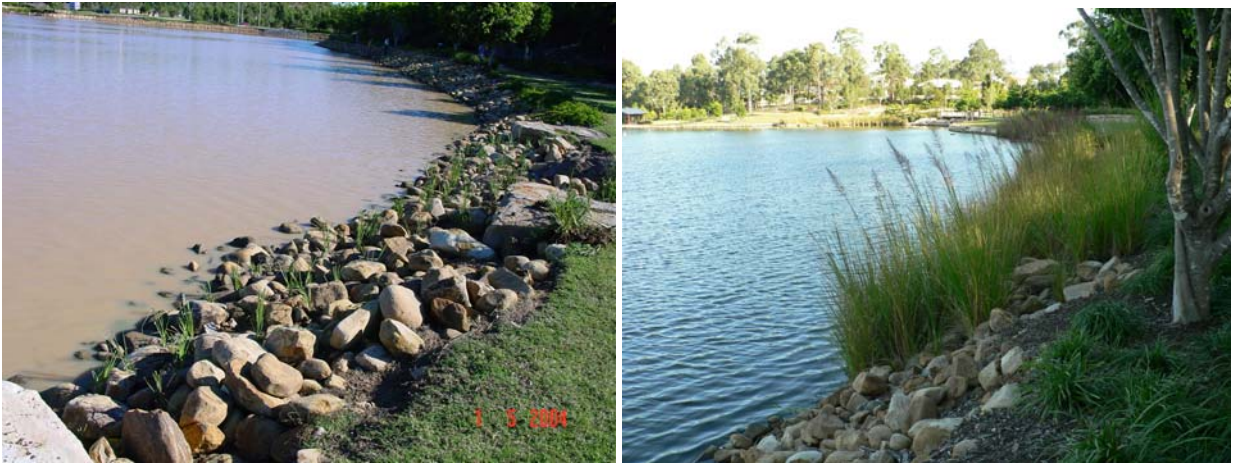
Photo 9: Planting along the lake shore purely for ornamental purpose