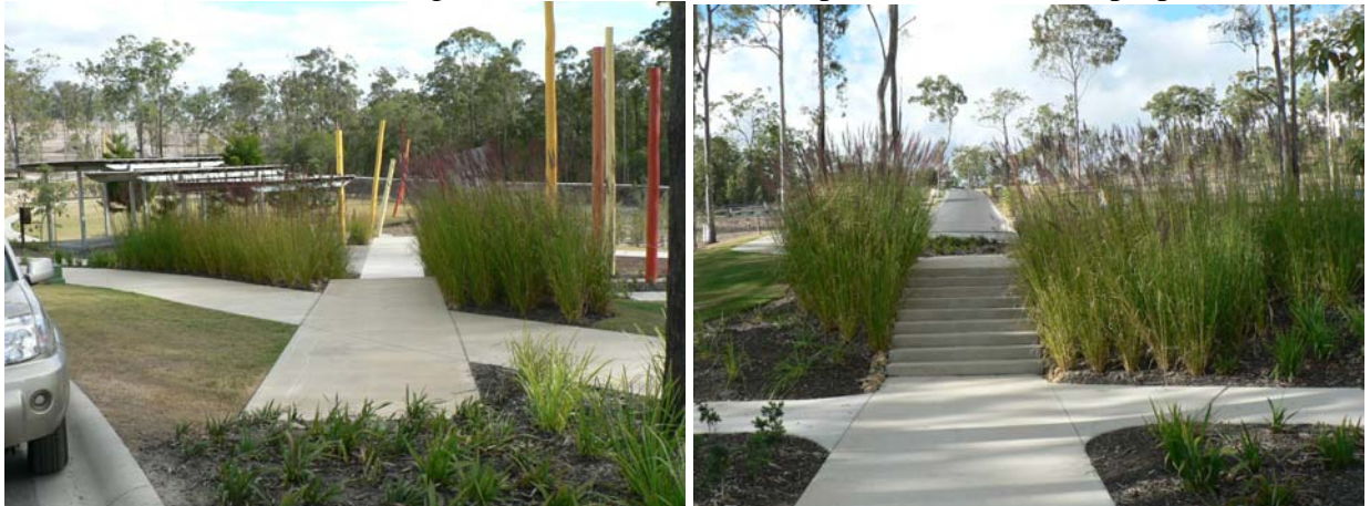
Photo 13: Planting at the entrance of a small park for ornamental purpose