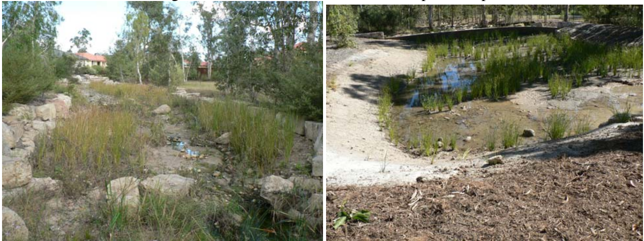
Photo 11: Planting on the swale floor and bio-retention pond for pollution control