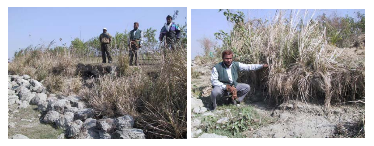
Fig. 5: Inspection of Vetiver roots by the author (growth is shorter than expected)

Fig.6 shows the well-grown vetiver with concrete frame (CF) toe protection trial at 62 Patenga (planted August 2001, Photo July 2002). It also shows that established Vetiver is browsing resistant. Fig 7- Vetiver grass on Concrete Frame- toe protection wall