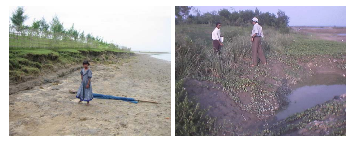
Fig 3: Vetiver planted at the seaside toe line.