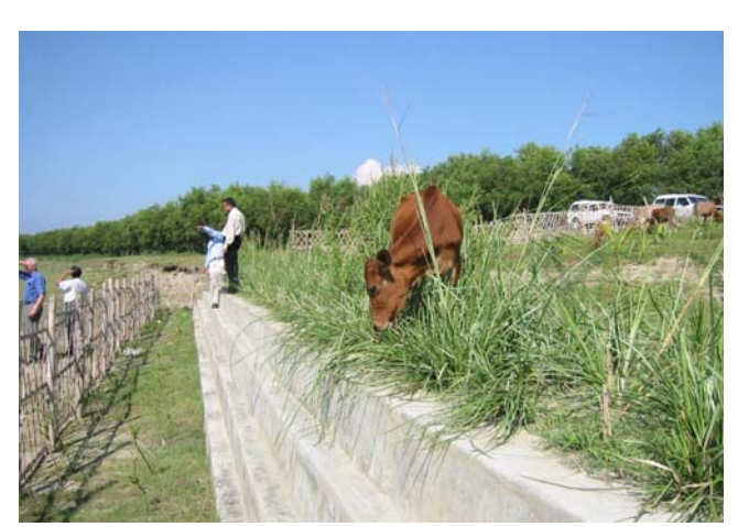
Fig. 6: Vetiver grass on Concrete Frame- toe protection wall

Fig.6 shows the well-grown vetiver with concrete frame (CF) toe protection trial at 62 Patenga (planted August 2001, Photo July 2002). It also shows that established Vetiver is browsing resistant. Fig 7- Vetiver grass on Concrete Frame- toe protection wall