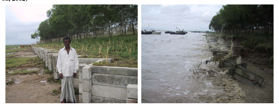
Fig. 8: Two months old Vetiver washed the highest tide of the year (August