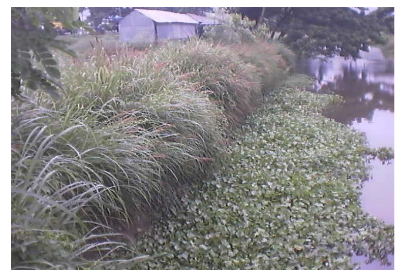
Fig 1: Vetiver growing naturally along the canal bank

Fig.1 shows the natural growth of vetiver along the canal bank at Comilla: